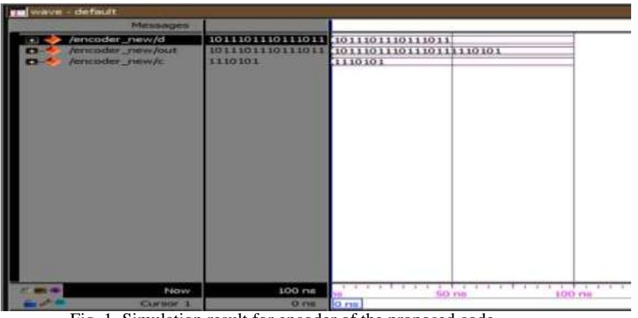
Fig. 1. Simulation result for encoder of the proposed code

The code for the proposed Hamming code was written in Verilog Hardware Description Language and the code was simulated on ModelSim SE 6.3f for a 16 bit data. It was tested for correct functionality by giving various inputs. The proposed code is synthesized on Xilinx 13.3 version and has been implemented on Spartan 3E FPGA kit. The simulation results of the encoder and decoder section of the proposed code is shown in Fig. 1 and Fig. 2. The input to the encoder is a 16 bit data and the output is a 23 bit code word. The 23 bit code word is the input to the decoder.